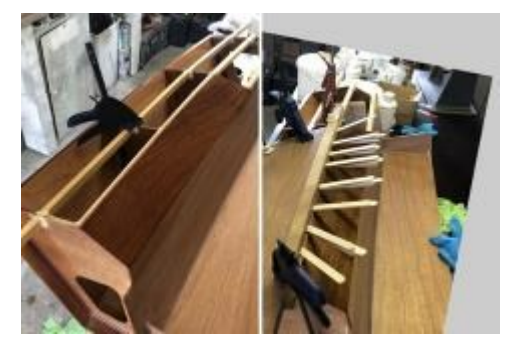
Left: Final deck rib fitting Right: Top deck curing

With the first section of deck cured, profiled and the internals coated, it was time to fit the deck rib and the last section of deck. As with a real build, the internal surfaces were coated with two coats of AMPRO<sup>™</sup> seal and then bonded, without any cleaning of the internals. Creative clamping is often required in these situations, mixing sticks are ideal for packing and wedging!