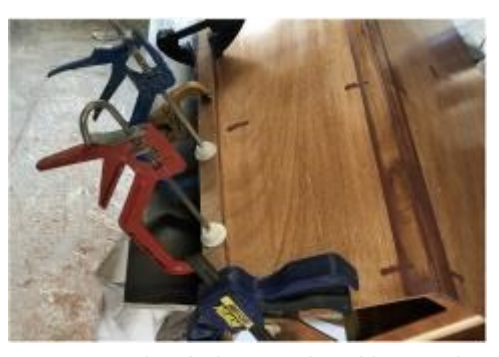
Bonding & clamping the rubbing strake

The last piece of structure to be added was the rubbing strake. This was bonded on using a AMPRO<sup>™</sup> mixed with Microballoons to ensure a similar colour match to the wood. In this instance, no screws were used, which may not be practical on a full size build. With the rubbing strake rounded and faired into the deck, the structure is finished.