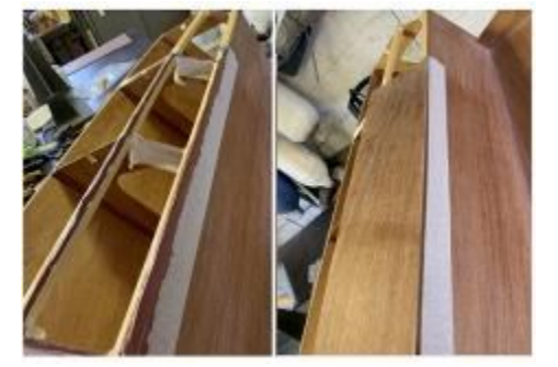
Left: Adhesive applied to bonding surfaces Right: Oversize deck section positioned

For the deck, an oversized piece of plywood was used to give a nice colour contrast, which was bonded using a mix of AMPRO<sup>™</sup> and Microballoons applied to the deck ribs and bulkhead tops. Once cured, the oversized deck section was then planed to achieve a perfect fit.