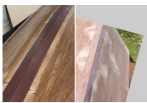
Left: Filler applied Right: Excess filler sanded off