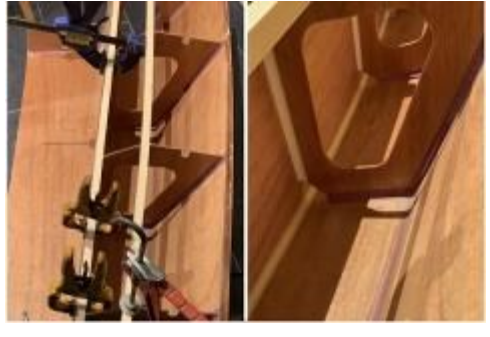
Left: Two deck ribs fitted Right: All types of fillet used

Then two of the three deck ribs were fitted, which would still allow access to complete most of the inside fillets. The fillets to the inside of the longitudinal bulkhead were made using a mix of AMPRO<sup>™</sup> and Glass Bubbles. More commonly these joints would use microballoons as these are the lightest form of fillet, however since we wanted a piece that demonstrated the full range of fillers available, glass bubbles were used. With the internal fillets completed, all of the inner surfaces of the buoyancy tank were then given a final coat of AMPRO<sup>™</sup> SEAL.